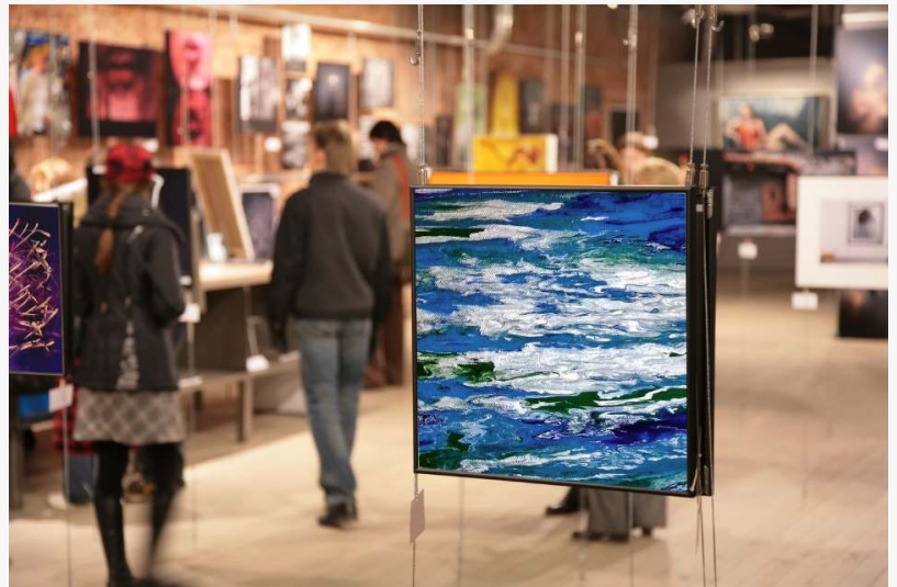
Online Art Gallery