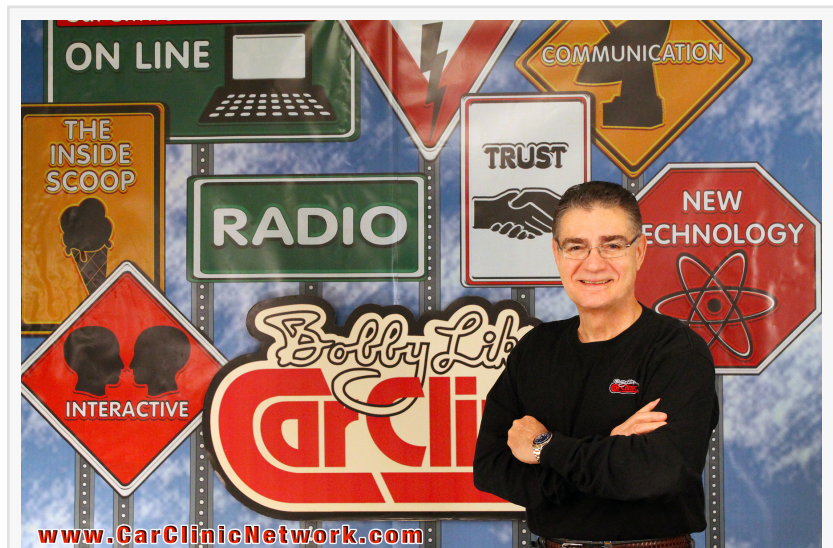
Automotive Expert & Car-Talk Host

The Environmental Protection Agency (EPA) has approved E15 (15% ethanol) fuel for use in all cars and light trucks, model year 2001 and newer. Across the U.S. transportation fleet, this accounts from more than eighty percent (80%) of vehicles on the road today, and that percentage will rapidly increase as consumers buy newer model year vehicles. Additionally, with the manufacture of automotive engines designed to capitalize on the high-octane, high-performance properties of ethanol above E15, the challenge is to build the infrastructure to support increased consumer demand.