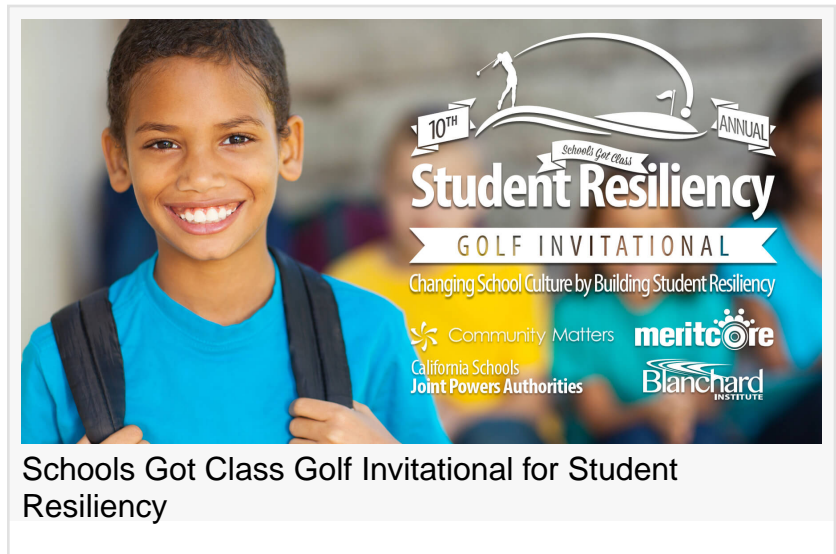
Schools Got Class Golf Invitational for Student Resiliency

The second program is a partnership between the Blanchard Institute and Meritcore, who together are building