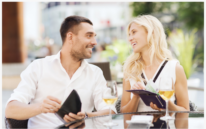
Split the Bill