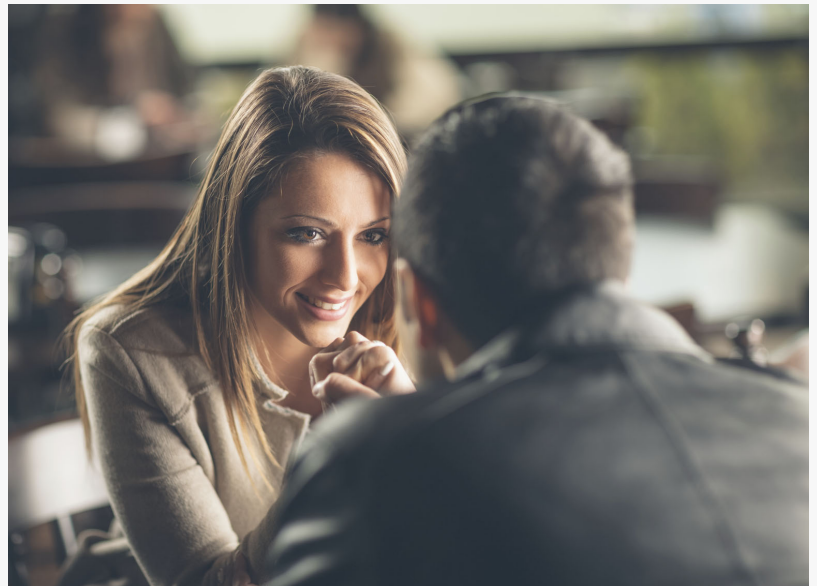
First date tips