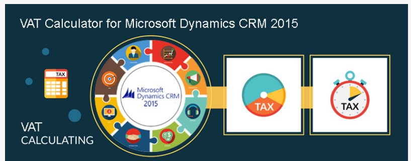
VAT Calculator 2015

This press release can be viewed online at: http://www.einpresswire.com