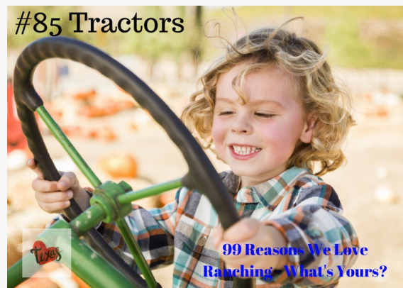
Reason #85 - Tractors

Lem Lewis answers your questions about buying or selling a ranch