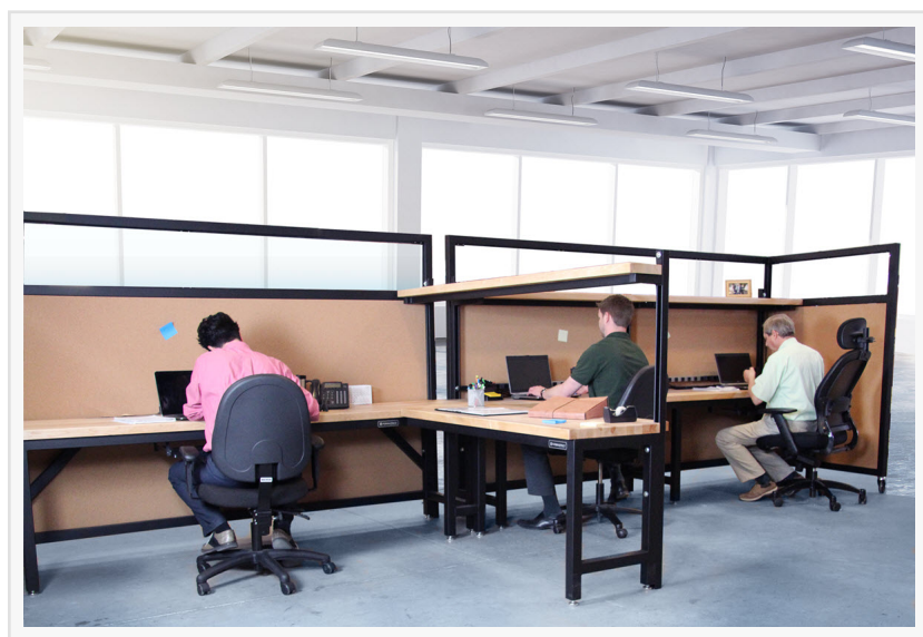
Formaspace Expands to Office Market

The client contacted our team of design consultants and Formaspace began making her dream office a reality. During the site survey, it became clear that people would benefit from desk to desk division. Our consultants proposed partitions with an elegant tempered glass