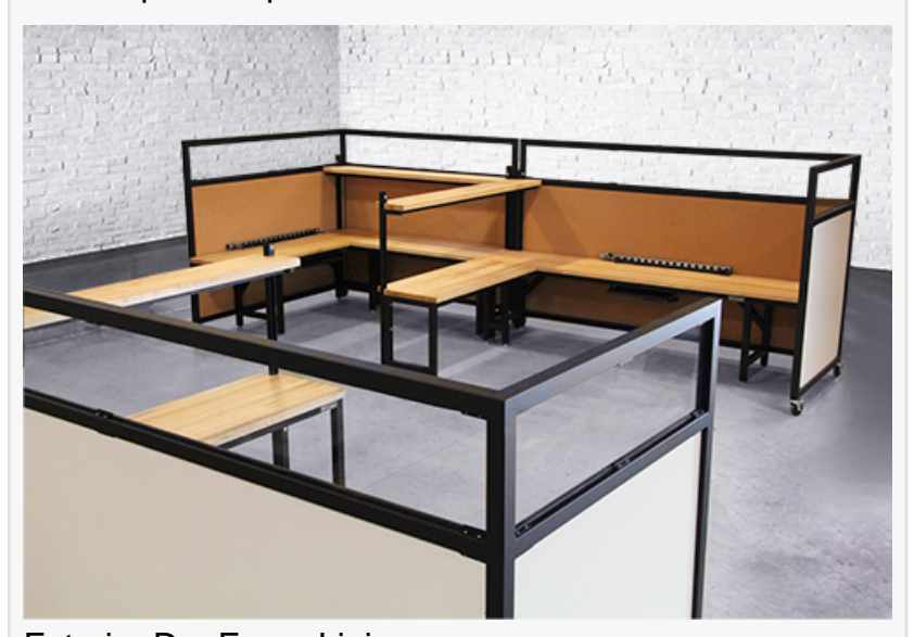
Exterior Dry Erase Lining

top, interior cork board lining, and exterior dry erase panels to refine the original concept. Once our <u>industrial design</u> and engineering team joined the project, they found additional opportunities to enhance the client's original concept.