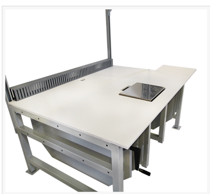
Flush Scale, Cable Management and Lower Adjustable Dividers

After carefully considering their process flow, Formaspace delivered a tailored packing station with built-in ergonomic features for multi-shift operations, highly customized organization elements that