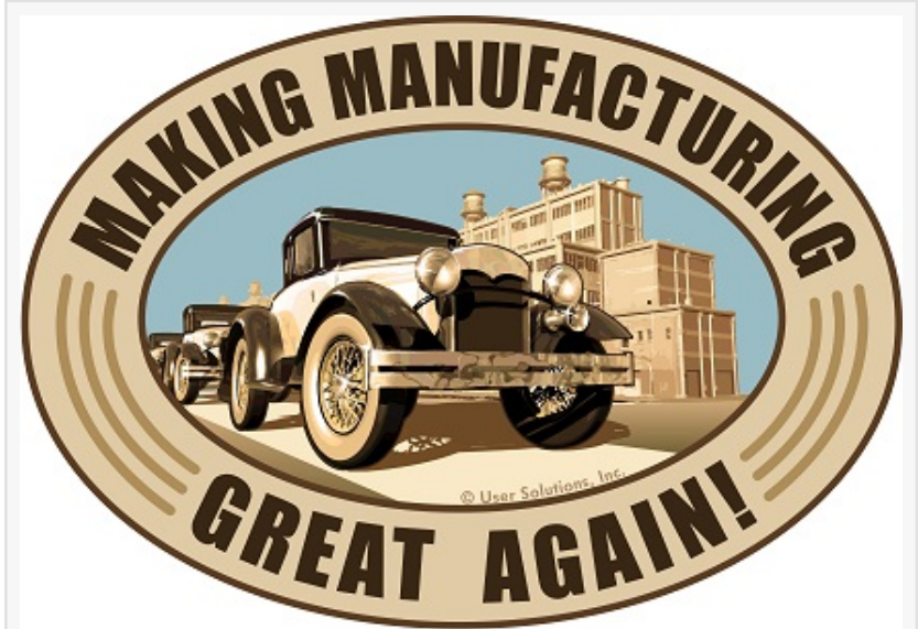
Making Manufacturing Great Again