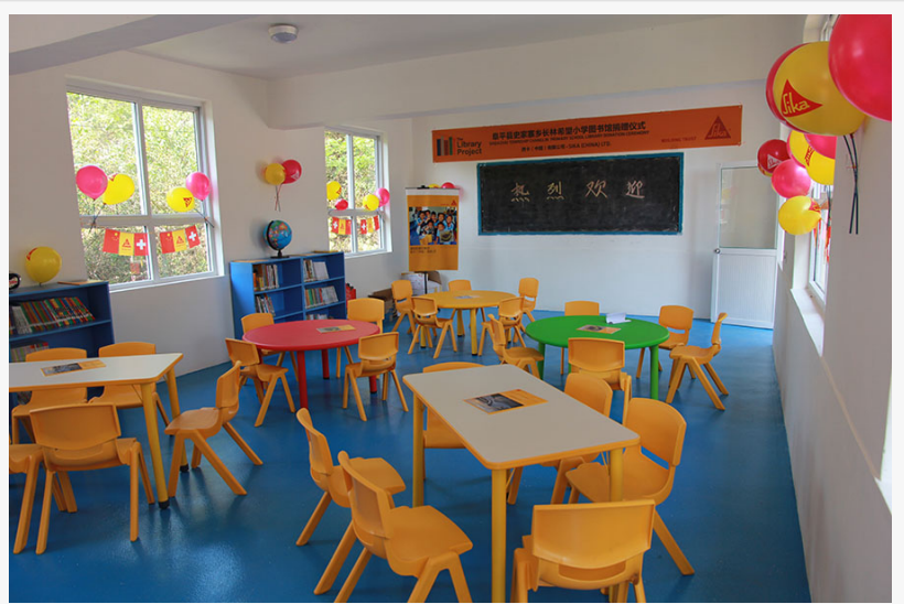
Reading room refurbished with Sika construction products.

With its regional headquarters based in Suzhou Industrial Park, Sika China operates 9 production factories and a marketing and sales network throughout China. With excellent quality and diversified products, Sika China provides customers with all around solutions as well as strong technical support.