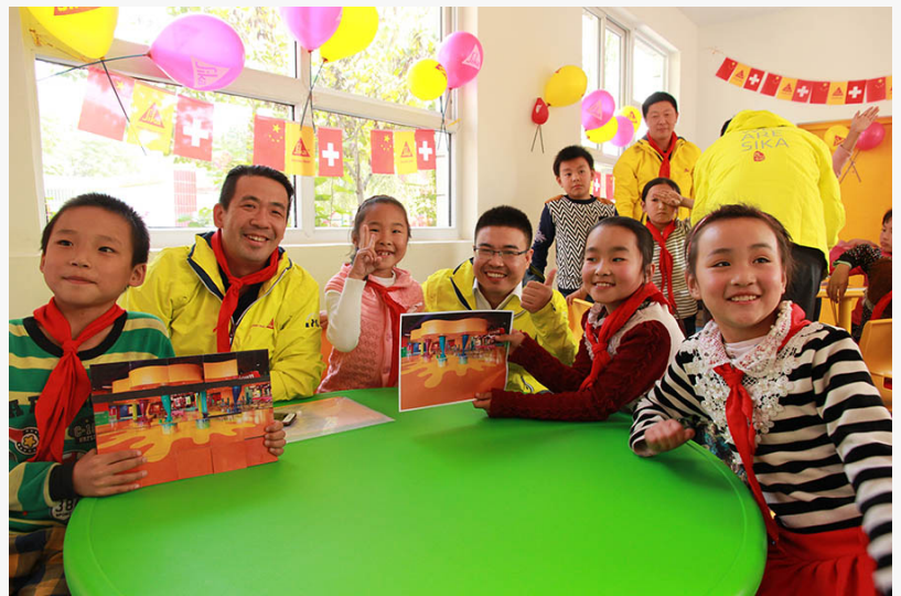
Sika Volunteers with the children