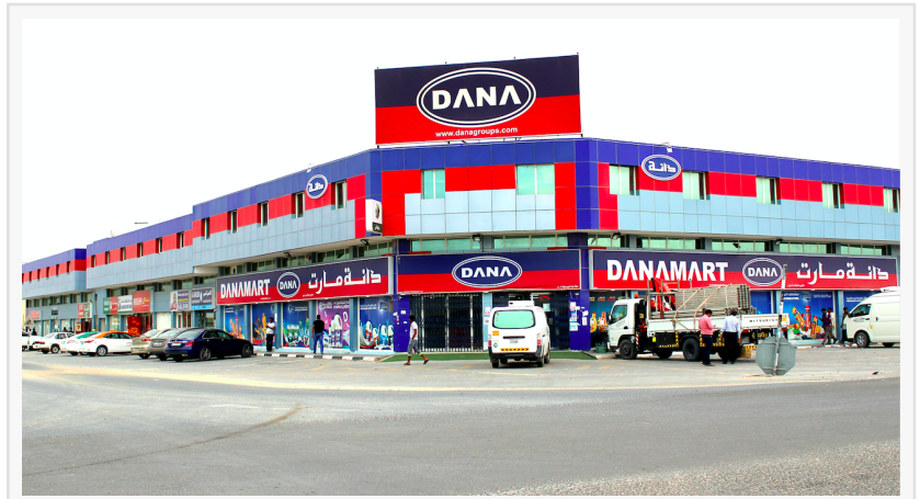
Dana Group's Retail division Dana Mart Hypermarket in Ajman, UAE

The UAE - India Economic Forum is the definite platform for business leaders and government authorities to discuss and evaluate trade, bi-lateral relations, and investment opportunities between the two strong economies. The 2015 event was inaugurated by Hon. Shri Arun Jaitley, Finance