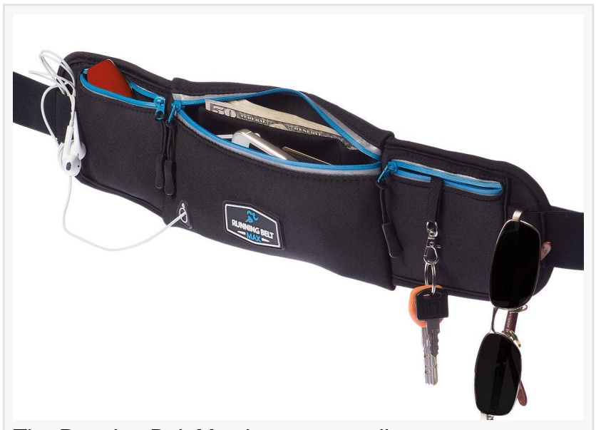
The Running Belt Max is very versatile