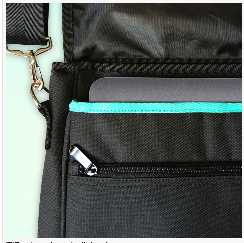
TiBag's unique built in sleeve.

His dilemma brought out the entrepreneur in him and he said, "screw it, I'm making my own."