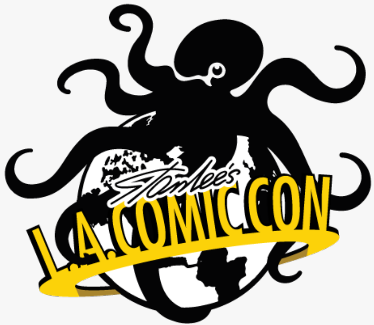
Stan Lee's LA Comic Con