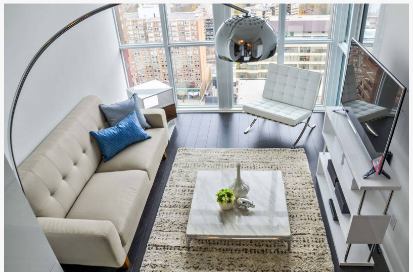
Living room designed, delivered, set up by Furnishr in one day