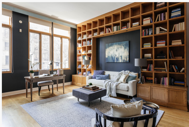
Living room designed, delivered, set up by Furnishr in one day

This press release can be viewed online at: http://www.einpresswire.com