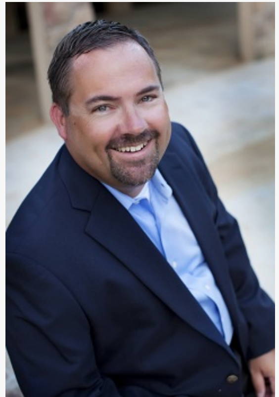
Luxury Institute Guild member