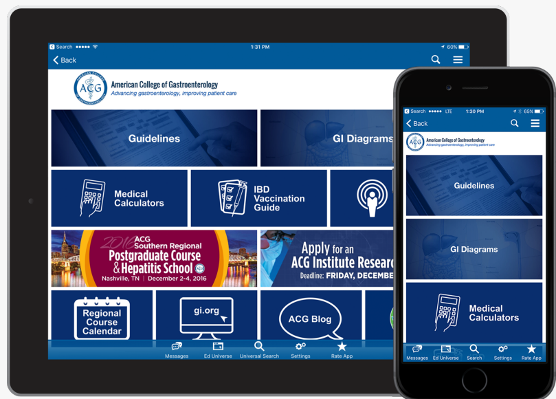
ACG 2016 eventScribe Conference App Homescreen

To learn more about eventScribe apps and the new association and meeting management features, contact CadmiumCD directly .