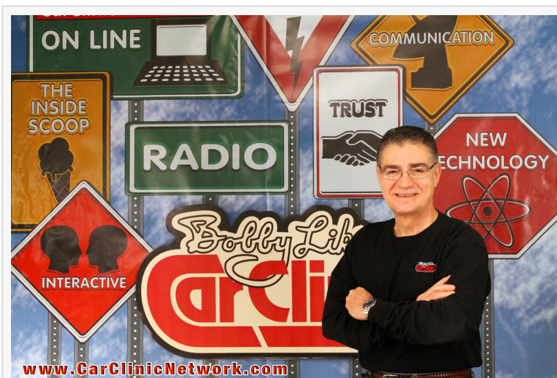
Automotive Expert & Car-Talk Host

Says Likis, "Tune in to hear Mick net out the role that ethanol production plays in local, regional and national economics, not to mention national security." He expands, "Also, top of mind is the Renewable Fuel Standard (RFS) and why it's critical to the environment, economy, and security of the