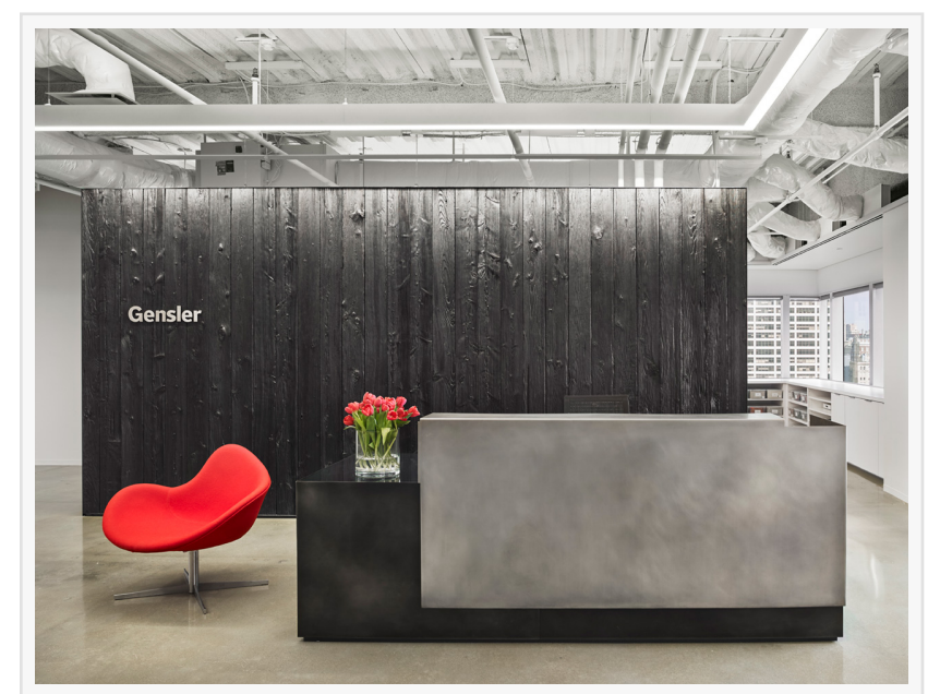
KINOKO reclaimed hemlock :: Gensler Office

Launched in 2003, NeoCon East has positioned itself as the premier design expo and conference for interiors on the east coast. After twelve years in Baltimore, MD, NeoCon East changed its