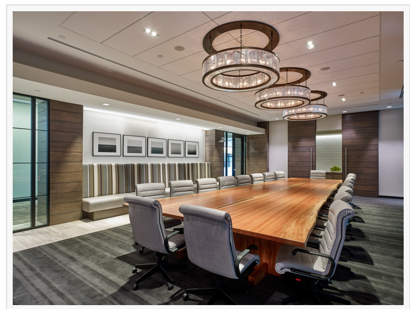
Live Edge Curly French Sycamore Boardroom Table :: Franklin Board Room

reSAWN's CHARRED collection is broken up into sub collections that allow for architects and designers to specify the ideal product for their design aesthetic. The CHARRED collection ranges from CHARRED black, fully