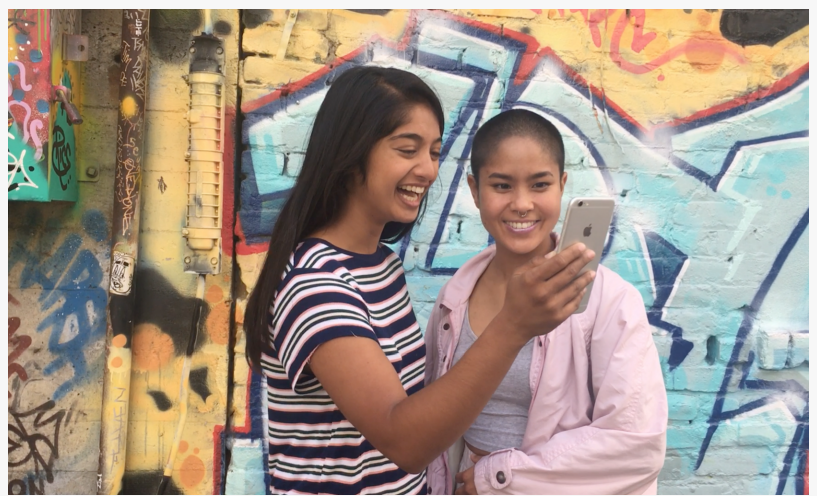
Watching a video on Pie