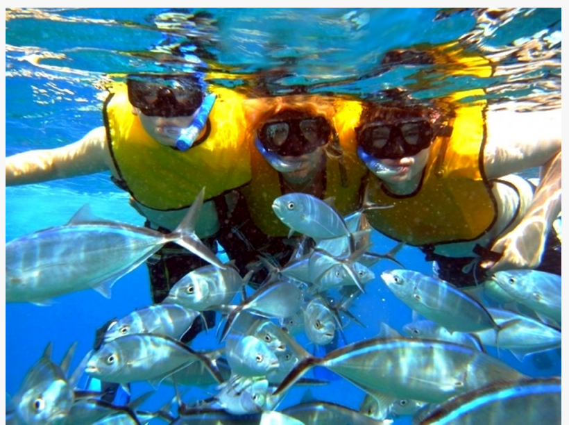
ISLA MUJERES ALL INCLUSIVE