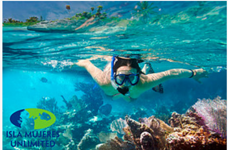
FUN Full Day Snorkeling, shopping, Mayan each BBQ Open Bar

The Updated Tour itinerary for 2017 will include the following tours.