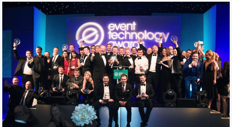
CadmiumCD Wins Big at ETA with two awards highlighting their event management and attendee engagement software

Not only did CadmiumCD take home the Best Event Management Solution and Best Conference