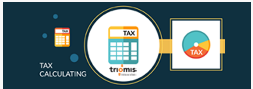
Dynamics 365 VAT Calculator