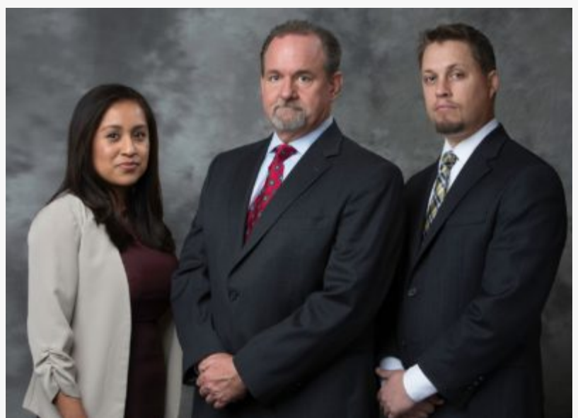
Hogie & Campbell Lawyers | (714) 508-6422 | www.firedme.com

We have handled cases involving high-level employees of Fortune 500 companies, as well as, minimum wage workers. If you believe you have been the victim of Discrimination, Harassment or Retaliation please read below to learn more.