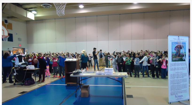
Sing-along to "The Lion Sleeps Tonight" with Memorial Elementary students