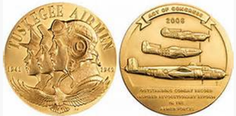
Tuskegee Airmen Congressional Gold Medal