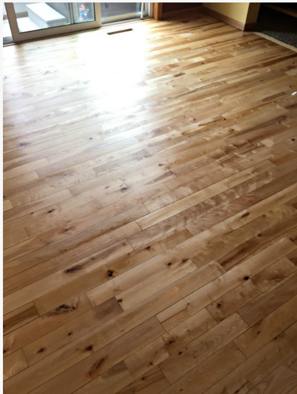
Expert Wood Floor Refinishing and Restoration