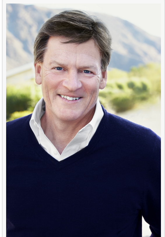
Bestselling author Michael Lewis discusses his new book "The Undoing Project."

Mindy Kaling is an actor, writer, producer, and director. She currently stars in the Hulu original comedy series "The Mindy Project," which she also writes and executive produces. Prior to "The Mindy Project," Mindy was best known for her work on the critically acclaimed, Emmy Award-winning NBC show "The Office." In addition to directing, producing, and