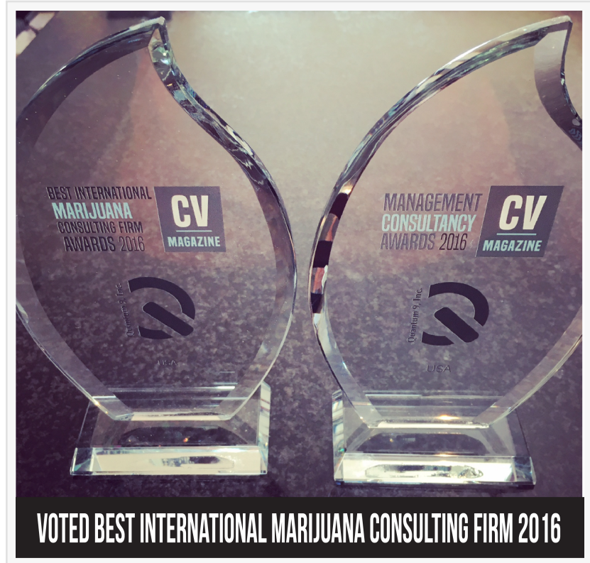
Best International Cannabis Consulting Firm Corp Visions

Taking on everything from business strategy, expert opinion, analysis, corporate case studies, emerging trends, leadership, growth opportunities, and the challenges facing our country's foremost business leaders, Corporate Vision is an