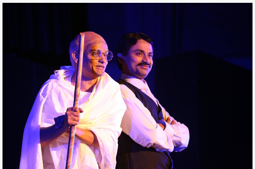
Still from the play 'Yugpurush- Mahatma ke Mahatma' depicting the journey of Mahatma Gandhi from Mohandas to Mahatma

The play is set to inspire audiences in South India in January 2017, followed by Gujarat in February and April, East India in March, Europe in May, North America in June - July, Middle East and Africa in September, and Australia and South East Asia in November.