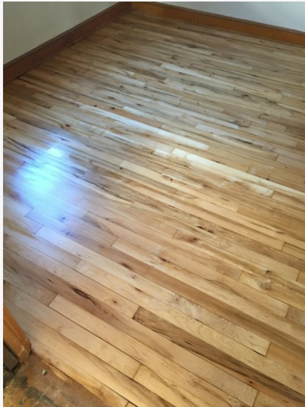
Royal Wood Floors Hard Wood Flooring Specialists

“The best way to prevent problems is to always do the research first or seek professional help. Then problems such as the ones described here can be prevented,” says Allman.