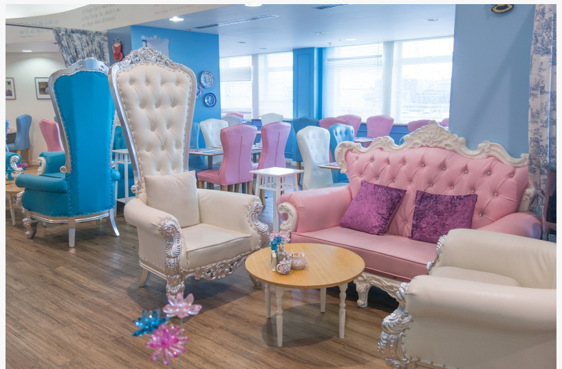
an interior shot of The Tea Terrace in London