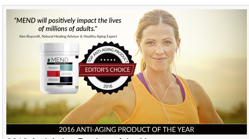
2016 Anti-Aging Product of the Year

NEW YORK, NY, UNITED STATES, January 19, 2017 /EINPresswire.com/ -- Nutrition For Healing (NFH) announced today that Orange County Orthopedic Group, a busy sports medicine practice in California has adopted MEND to complement their surgery and healing protocol. The relationship was established by NFH's medical distribution partner MDGenesis LLC.