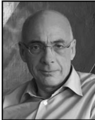
Da-Volterra Superbugs 2017