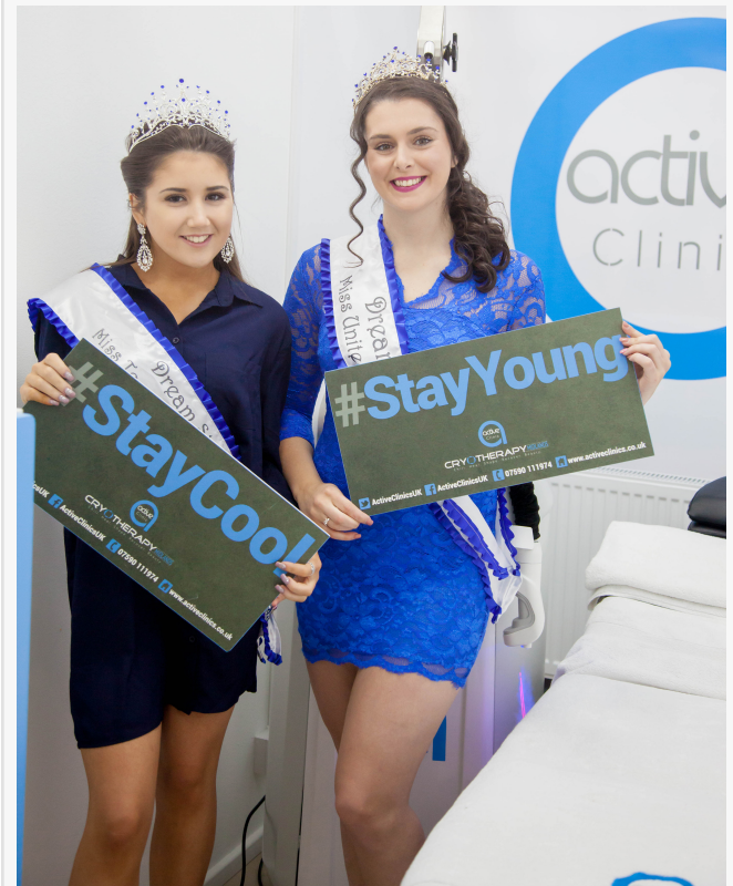
Reduce Sign of Aging