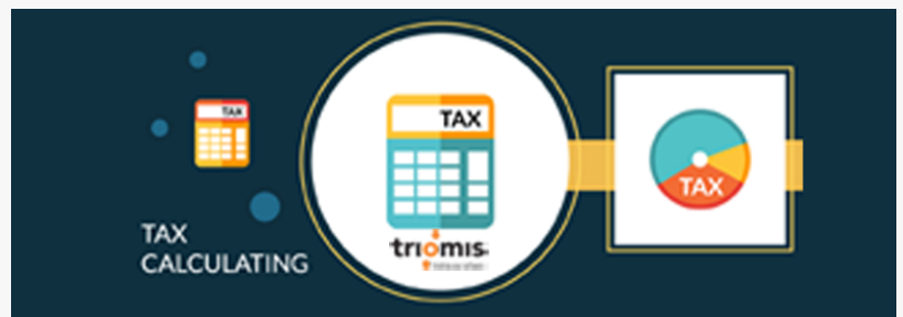
Dynamics 365 VAT Calculator

This press release can be viewed online at: http://www.einpresswire.com