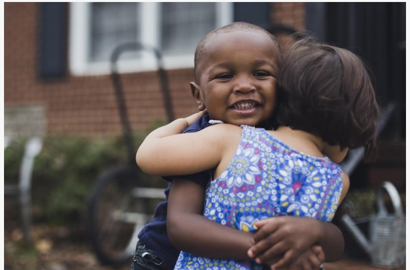
Adopted!