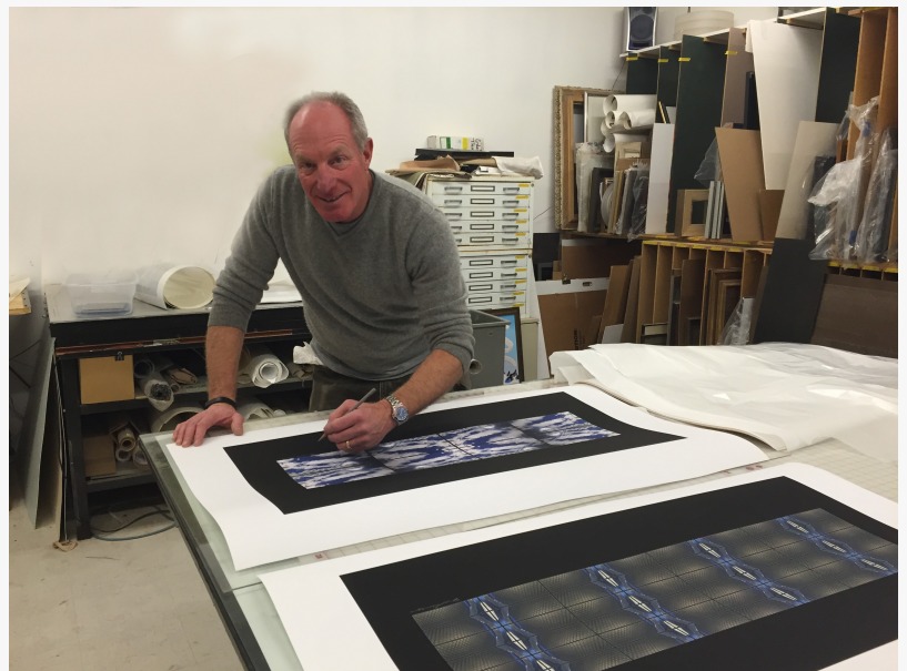
David Wiener Fine Art