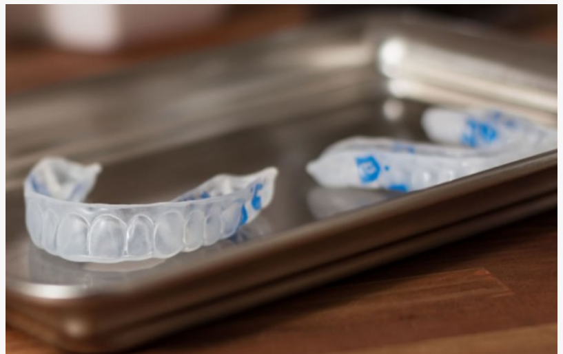
Perio Trays by Perio Protect