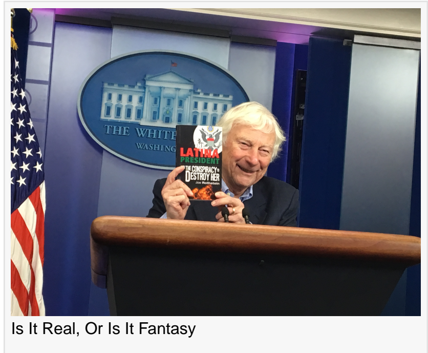
Is It Real, Or Is It Fantasy

The story Rothstein tells opens with high drama, and, as one reviewer says, "winds you up and, like it or not, slaps you around" until its totally unexpected last chapter. Award-winning Latino journalist Dick