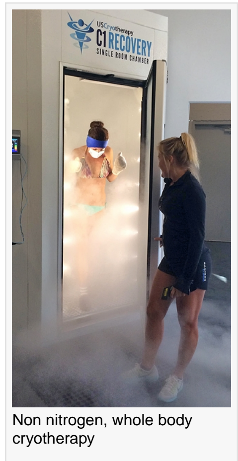
Non nitrogen, whole body cryotherapy

Kevin Kramer US Cryotherapy 7073017690 email us here