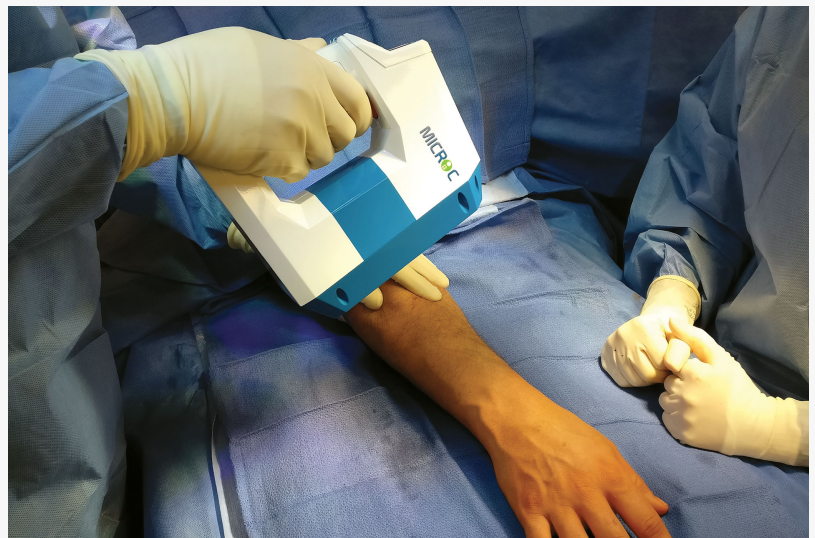
Micro C™ is ideally suited for surgeries of the extremities

This press release can be viewed online at: http://www.einpresswire.com