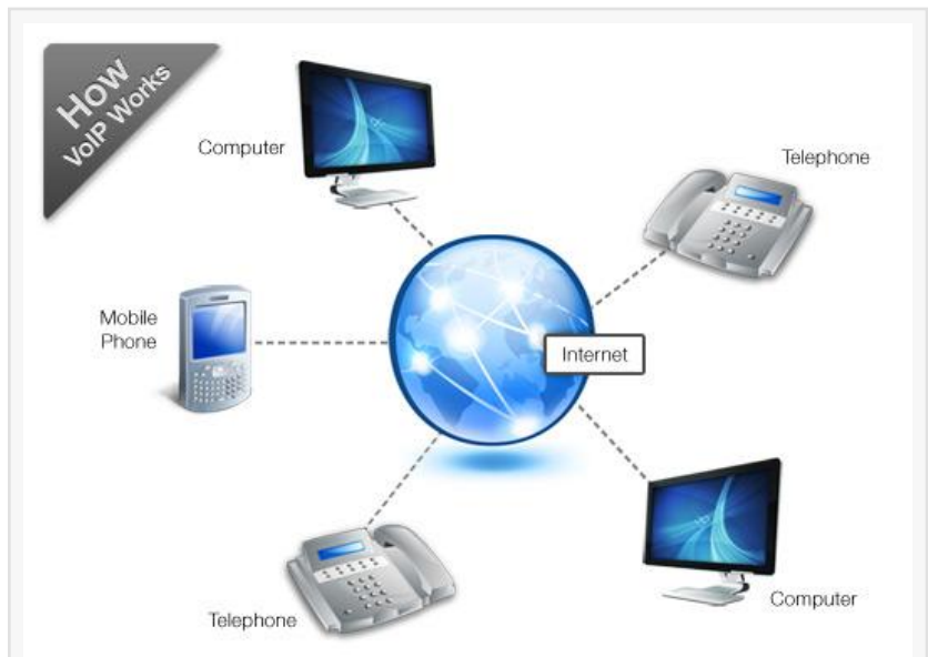
How Voip Works

With current expansions in the following southern cities and states: