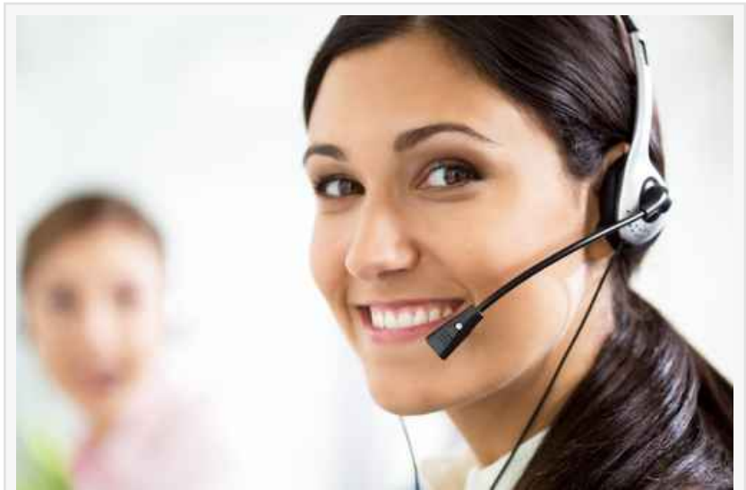
Voip for Call Centers

Louisiana; Baton Rouge, Louisiana Lafayette, Louisiana New Orleans, Louisiana Shreveport-Bossier City, Louisiana