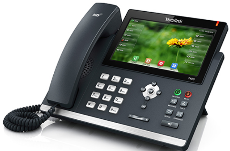
TieTechnology VoIP Enabled Business Phones