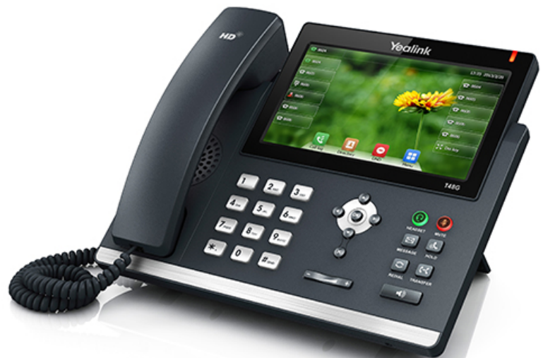
TieTechnology VoIP Enabled Business Phones