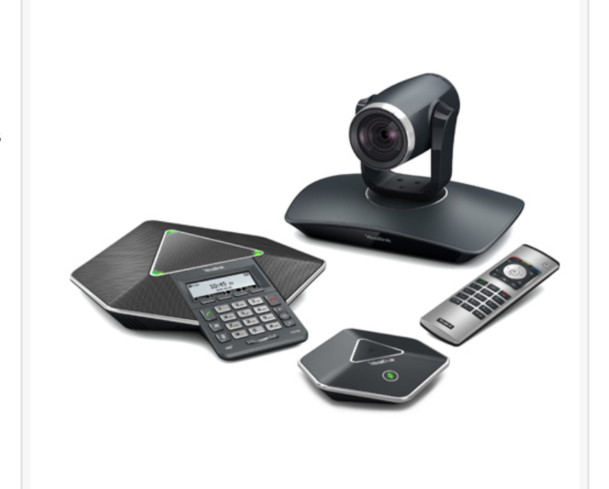
Yealink Unified Communications Conference Video