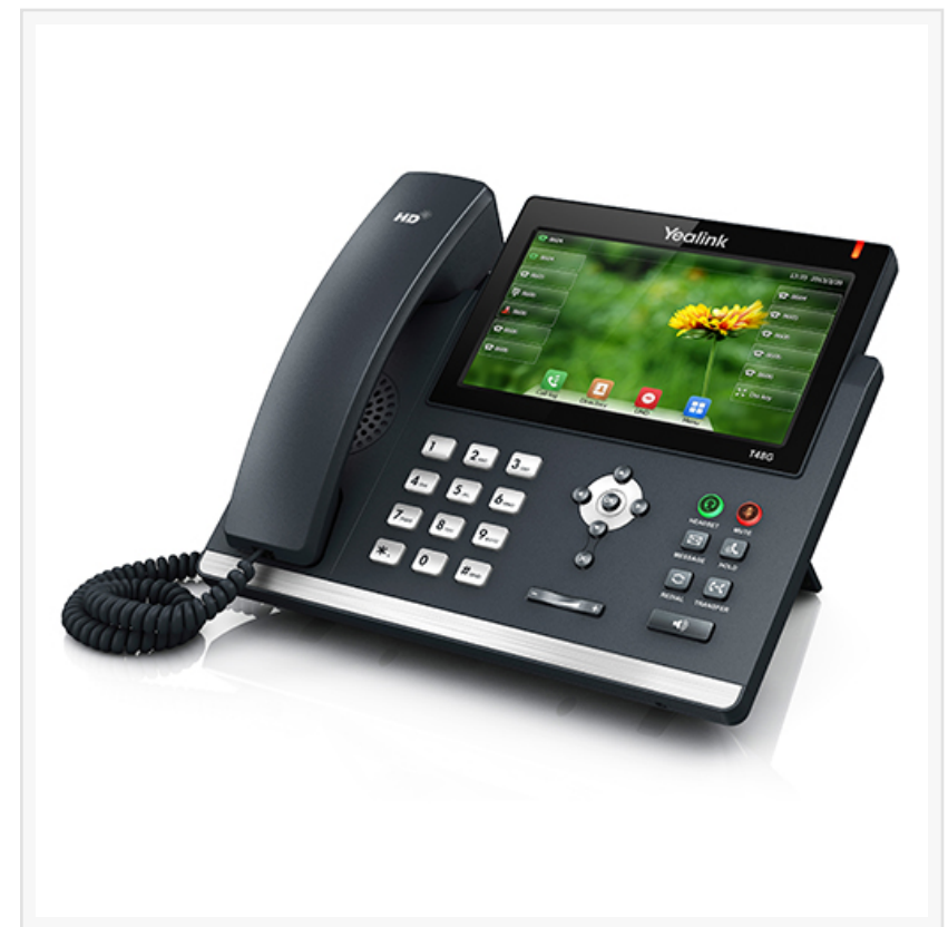
Business Phones for Flower Shops by TieTechnology

With rapid expansions that are exploding in the following southeastern states and cities: