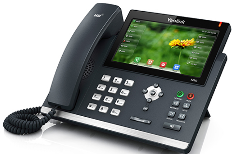
TieTechnology VoIP Enabled Business Phones