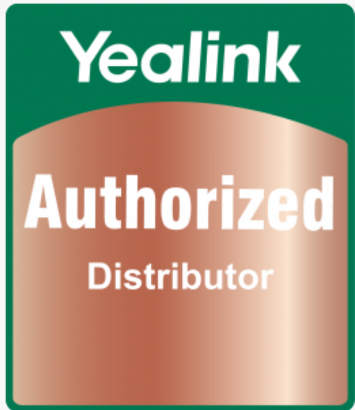
Yealink Authorized Distributor

Alaska, Arizona, Arkansas, California, Colorado, Connecticut, Delaware, District of Columbia, Florida, Georgia, Idaho, Illinois, Indiana, Iowa, Kansas, Louisiana, Maine, Maryland, Massachusetts,