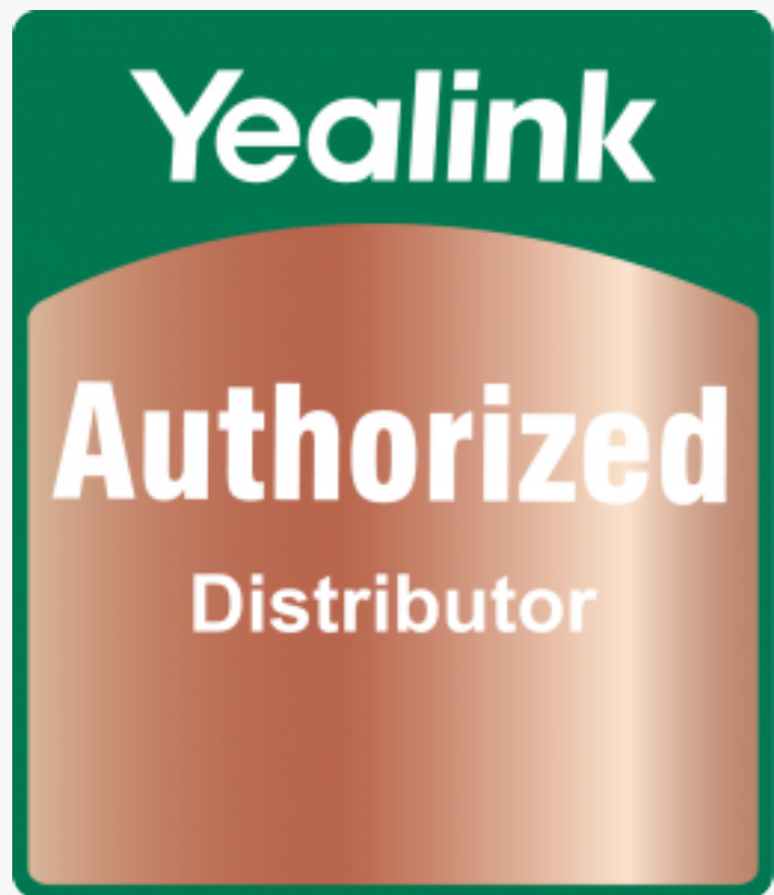
Yealink Authorized Distributor

Alaska, Arizona, Arkansas, California, Colorado, Connecticut, Delaware, District of Columbia, Florida, Georgia, Idaho, Illinois, Indiana, Iowa, Kansas, Louisiana, Maine, Maryland, Massachusetts, Michigan, Minnesota, Mississippi, Missouri, Montana, Nebraska, Nevada, New Hampshire, New Jersey, New Mexico, New York, North Carolina, North Dakota, Ohio, Oklahoma, Oregon, Pennsylvania, Rhode Island, South Dakota, Tennessee, Texas, Utah, Vermont, Washington, Washington DC, West Virginia, Wisconsin, and