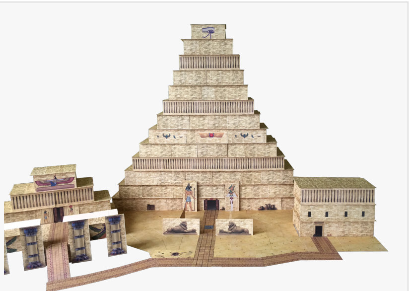
Card House built from Kardtect's Lost Desert Starter Set and Expansion