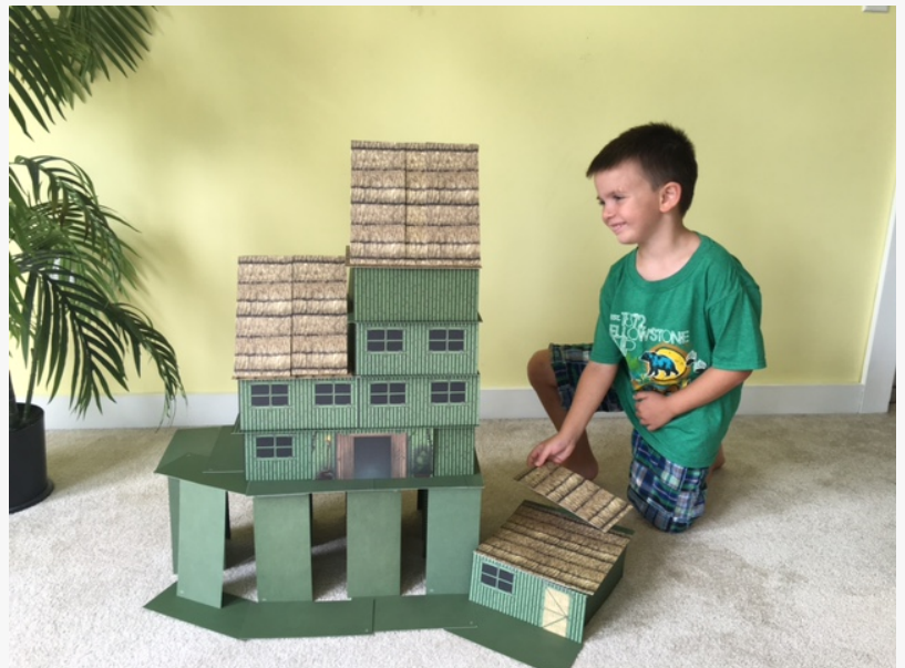
Kardtect's Forbidden Jungle starter set

This press release can be viewed online at: http://www.einpresswire.com