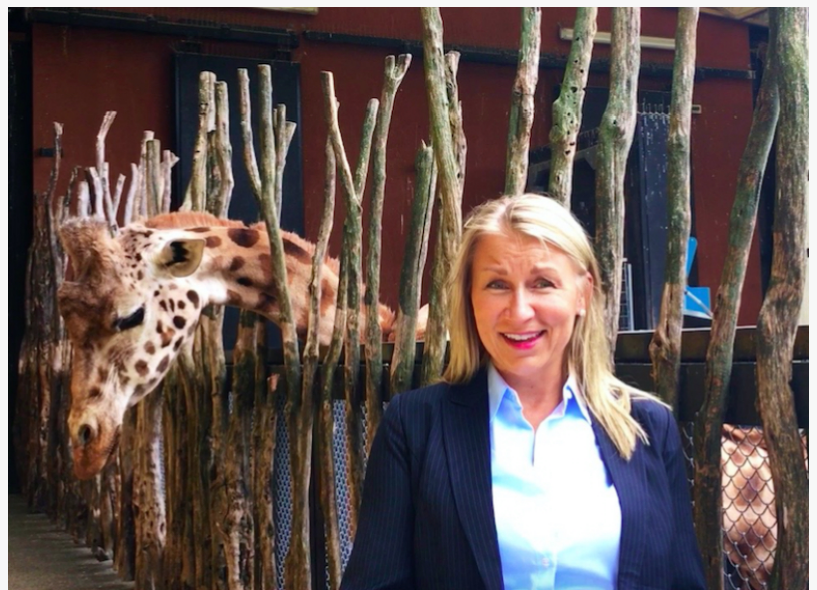
Online Dating - It's a ZOO out there!